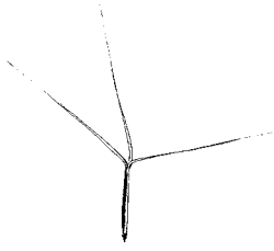
Red threeawn floret with awns. Actual length of seed and upright awn is 1¾ inches.